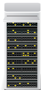
Yealink RPS Server

The Yealink T4S supports efficient provision and effortless mass deployment with Yealink's free Redirection and Provisioning Service (RPS). Furthermore, the T4S features a unified firmware and an auto-p template that apply to all phone models (T41S, T42S, T46S and T48S), saving even more time and IT costs for businesses.